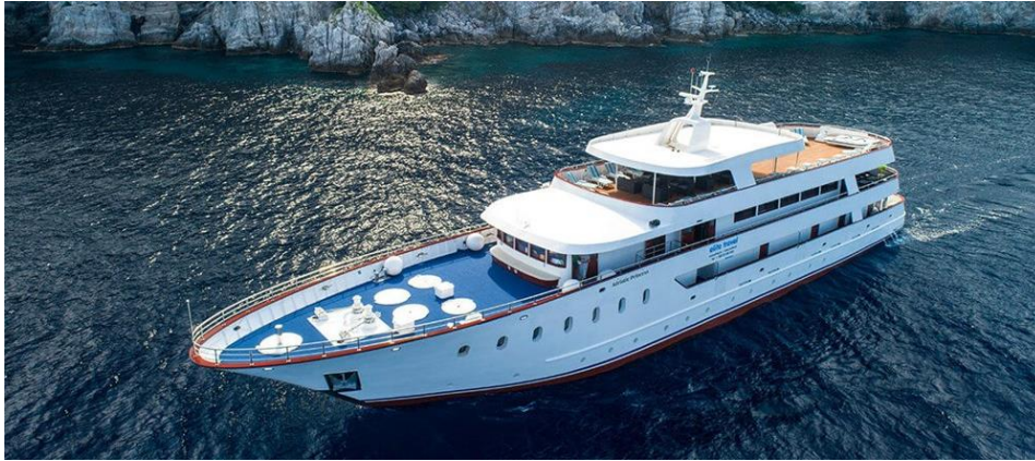
Figure 1 Our Ship, the MV Adriatic Princess II