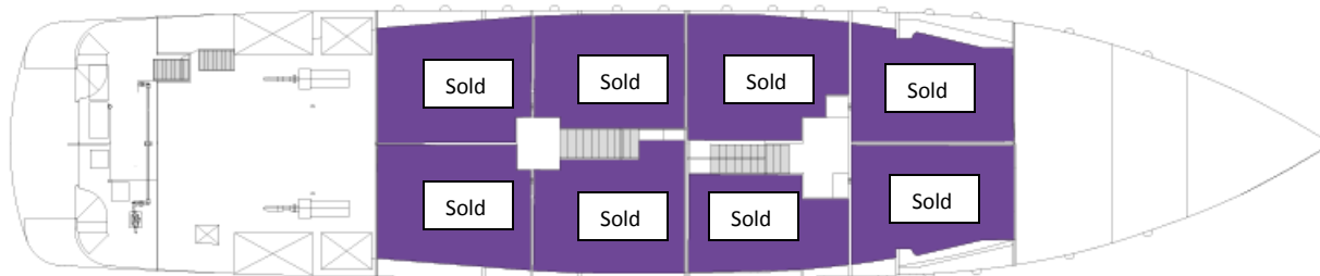
Figure 4 Lower Deck Staterooms