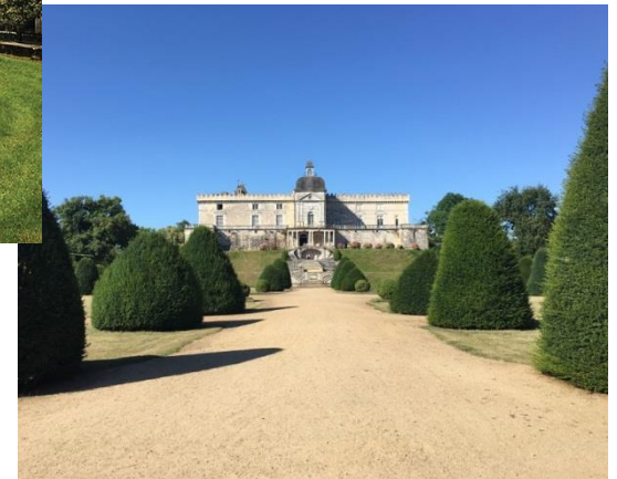
Château de Yayres