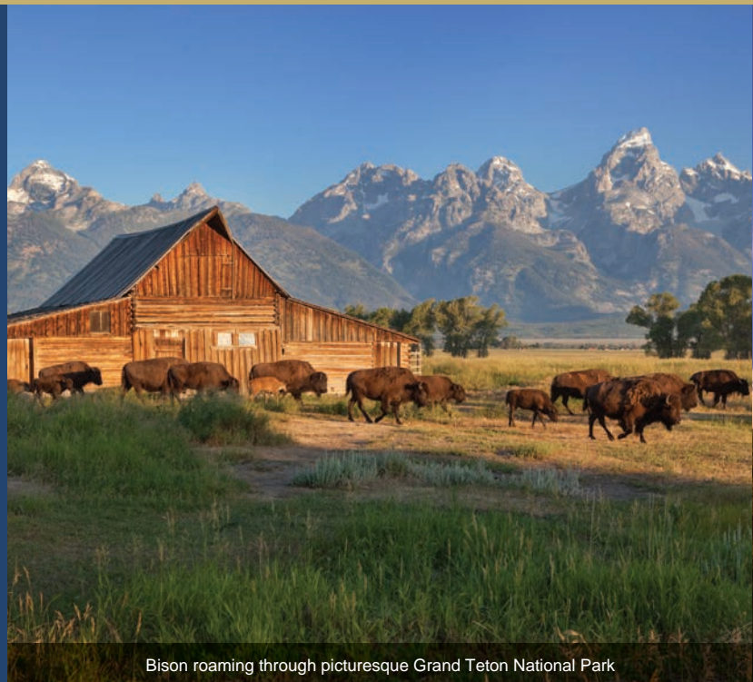
Bison roaming through picturesque Grand Teton National Park

Day One – DoubleTree Hotel, Denver, Colorado Days Two and Three – Holiday Inn Rushmore Plaza, Rapid City, South Dakota Day Four – Holiday Inn, Sheridan, Wyoming Days Five and Six – Yellowstone National Park Lodges, Yellowstone National Park, Wyoming Days Seven and Eight – Antler Inn, Jackson, Wyoming Day Nine – DoubleTree Hotel or Radisson Hotel, Salt Lake City, Utah