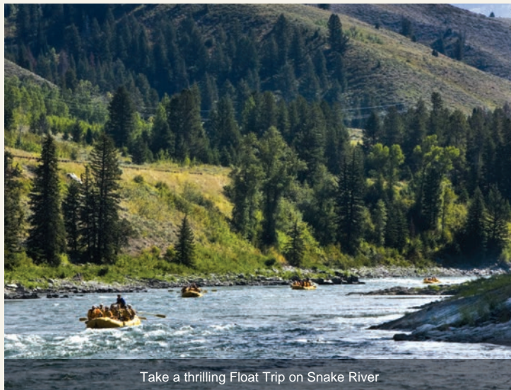
Take a thrilling Float Trip on Snake River

After breakfast transfer to the Salt Lake City International Airport for flights home anytime today. Meal: B