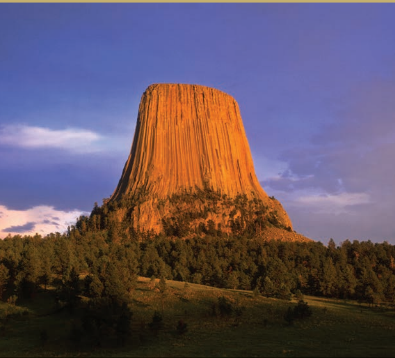
A "close encounter" awaits at Devils Tower