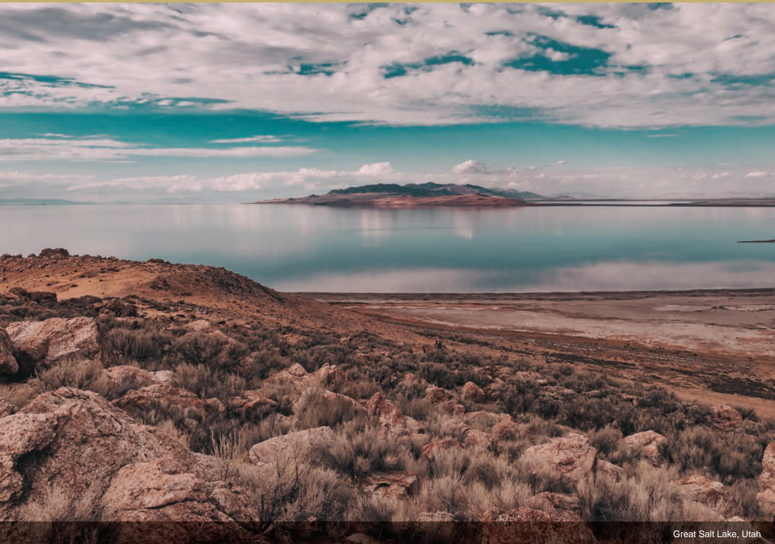
Great Salt Lake, Utah